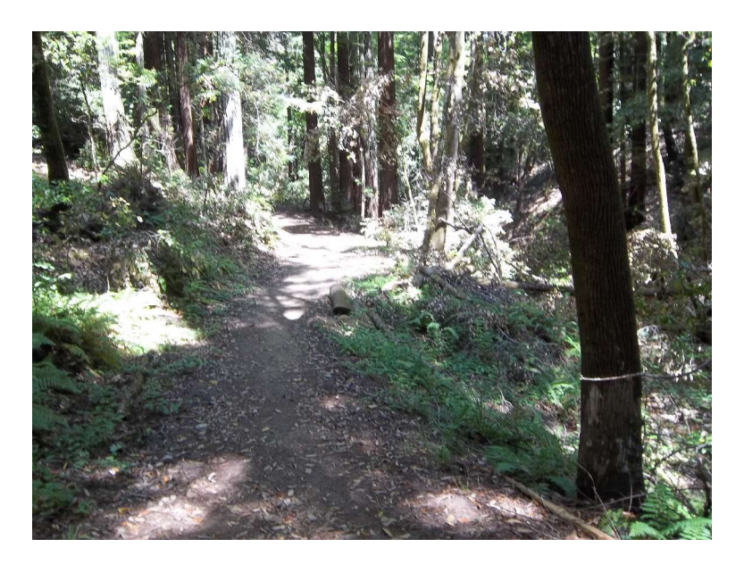
Trail looking north