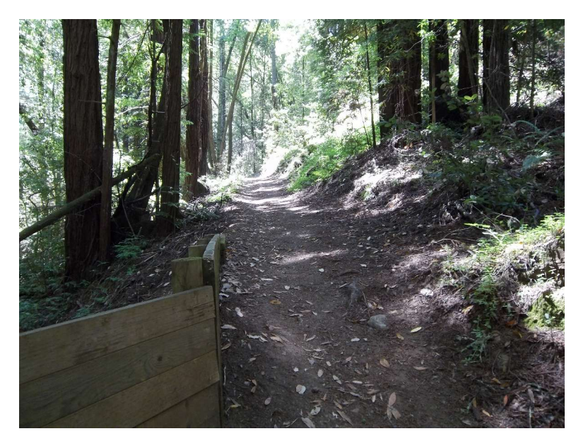
South on existing trail